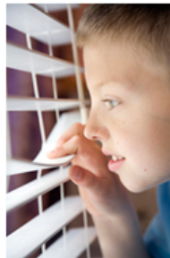
Planning with People