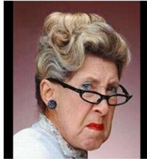
Planning with People